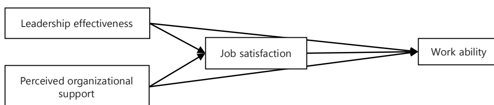
Fig 1. Research proposed model